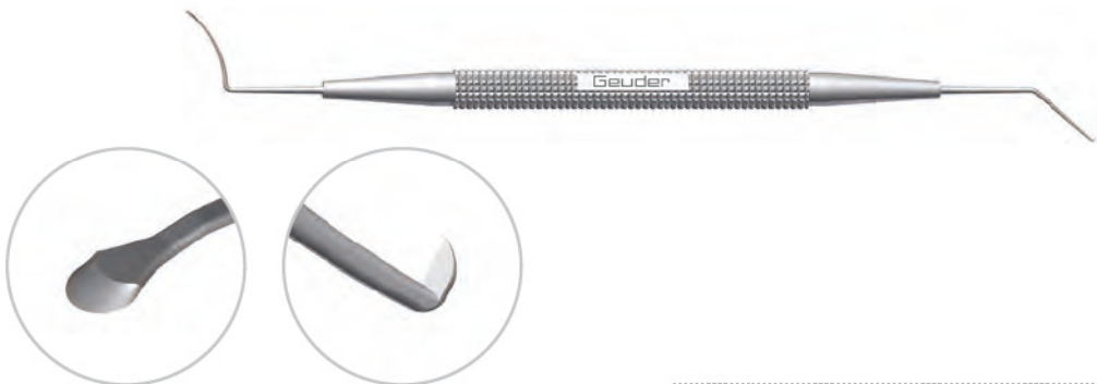
G-33942 BREYER FEMTOLASIK DOUBLE-ENDED INSTRUMENT Blum round spoon, modified by Breyer semi-sharp, hook with one blunt and one slightly sharp edge