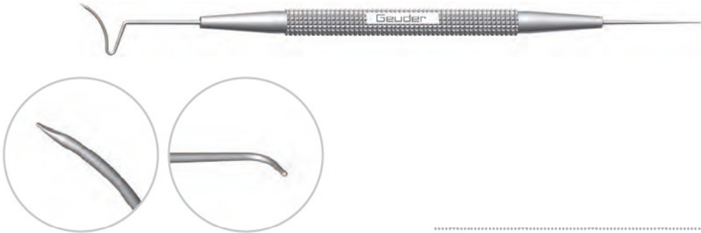
G-33958 PFÄFFL - BREYER FEMTOFLAPLIFTER V-spatula with recessed tip