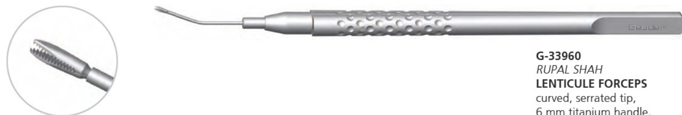
G-33960 RUPAL SHAH LENTICULE FORCEPS curved, serrated tip, 6 mm titanium handle, blue-colored