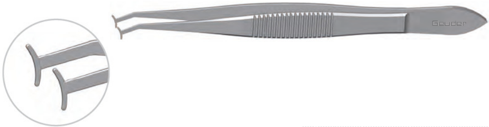
G-33429 KNORZ FEMTO-LASIK FLAP FORCEPS grasping surface roughened, curved