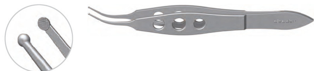
G-18914 BURATTO LASIK CORNEAL FLAP FORCEPS