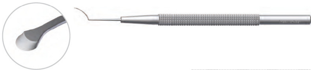
G-33940 BLUM FEMTOLASIK ROUND SPOON bevel up, semi sharp angled, with radius