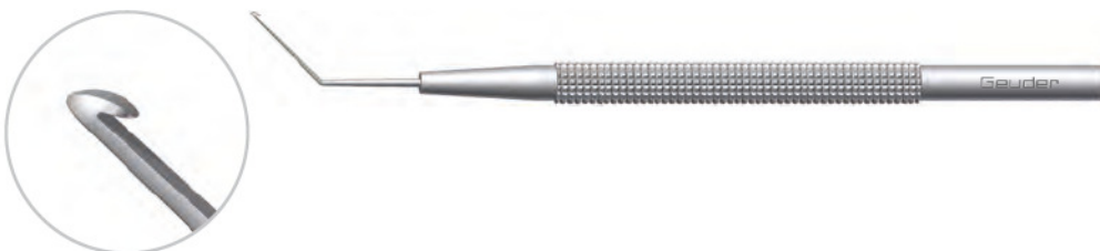
G-33959 BREYER FEMTOLASIK HOOK INSTRUMENT angled