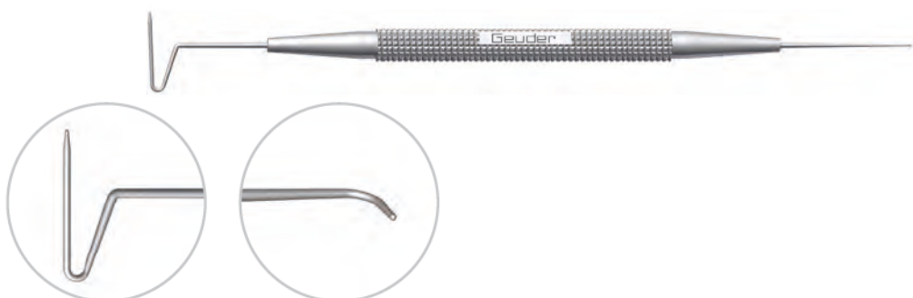
G-33943 PFAEFFL FEMTOFLAPLIFTER v-shaped hook with straight front part