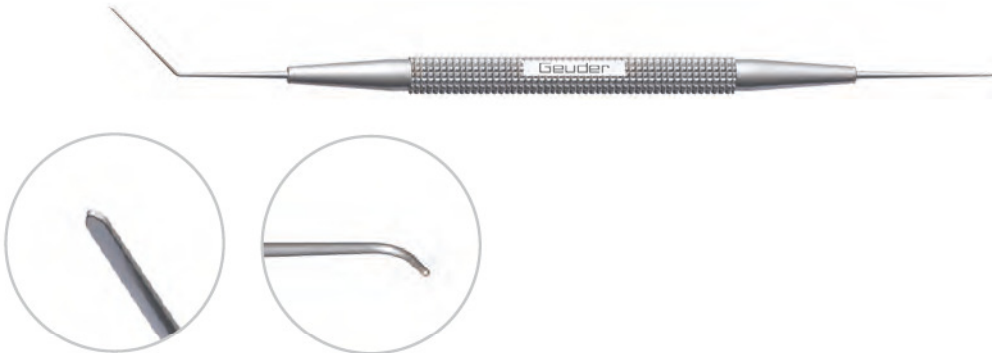
G-33944 KOHNEN FEMTOLASIK DOUBLE-ENDED INSTRUMENT spatula and blunt hook