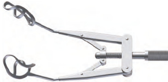
G-33965 DICK FEMTOCATARACT EYE SPECULUM open valves with middle bar, valve length 18 mm, total length 80 mm