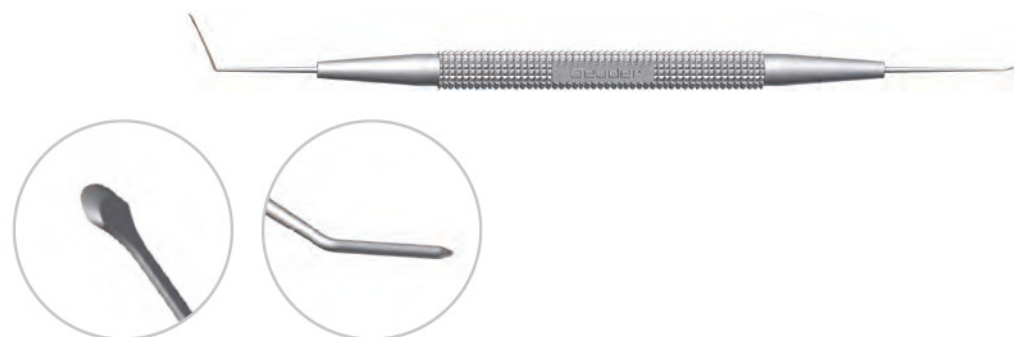
G-33954 GUELL FEMTO DOUBLE INSTRUMENT lenticule spatula, blunt spoon, rounded tip, slightly curved and hook