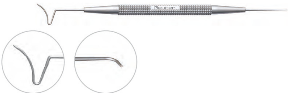
G-33427 PFAEFFL FEMTOFLAPLIFTER both tip ends blunt, curved part blunt